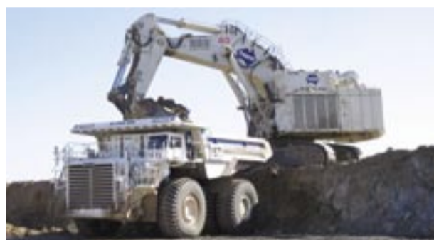
Noise suppressed hydraulic excavator loading a new 270mt haul truck with overburden.

You may recall from our previous newsletters that one of the key noise reduction strategies that Mt Owen committed to through the DA process was the phased introduction of noise attenuated equipment and we have made some important advancements in this area.