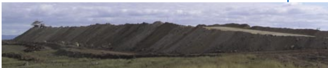
Construction of a noise bund on the eastern side of the West Dump.

We have made some pleasing progress on the construction of the West Dump which is a key component of Mt Owen's new Development Consent. The dump will take approximately six years to fill under the proposed dumping schedule and will be progressively rehabilitated. Overburden will also continue to be placed in-pit during this period.