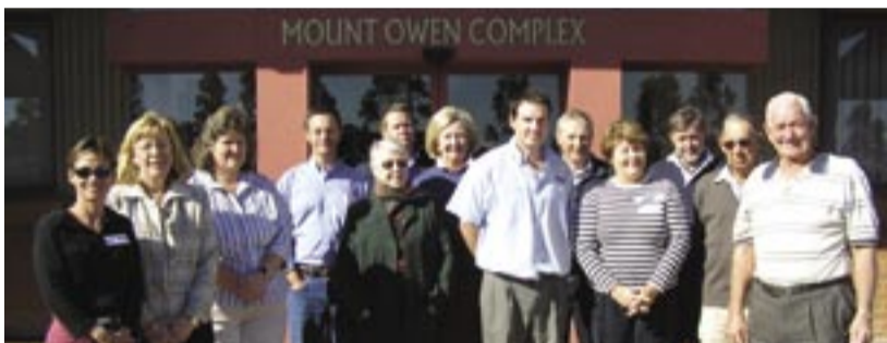
The Mt Owen Complex CCC.

At the moment, The Mt Owen Complex CCC is made up of a total of nine community representatives, four mine representatives, and three representatives from Singleton Council. A Councillor from Singleton Council chairs the meetings and Government representatives periodically attend the meetings.